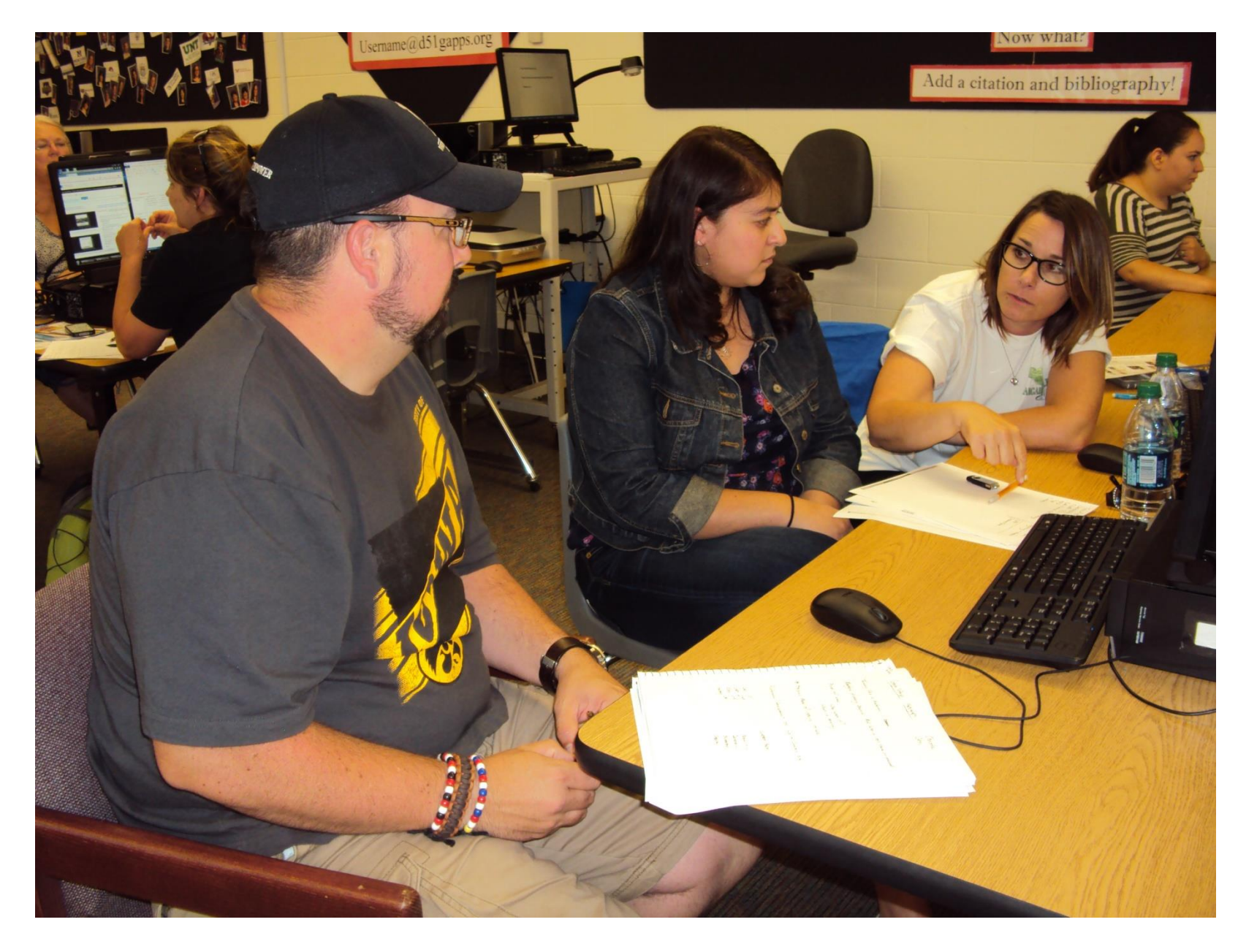
Preparing a lesson plan.