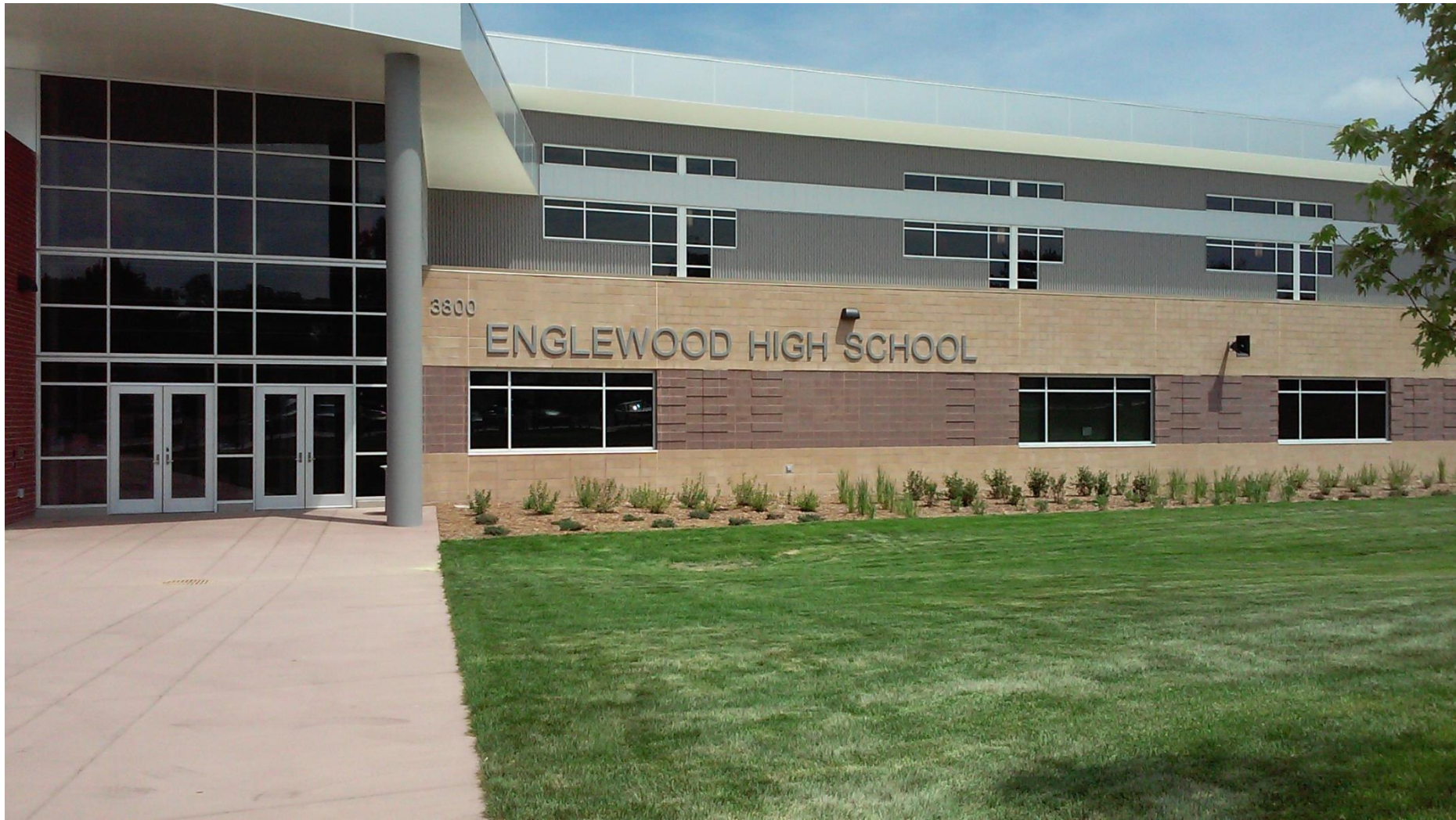
Englewood High School

Esri and ConnectED Sponsored a Geospatial Technology Workshop – Englewood, June 2015